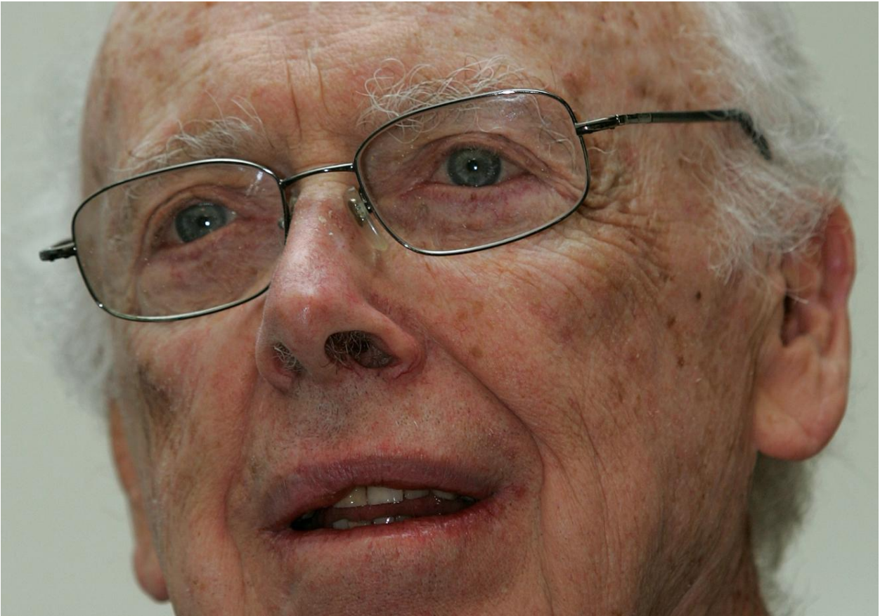
Facial detail of James D. Watson