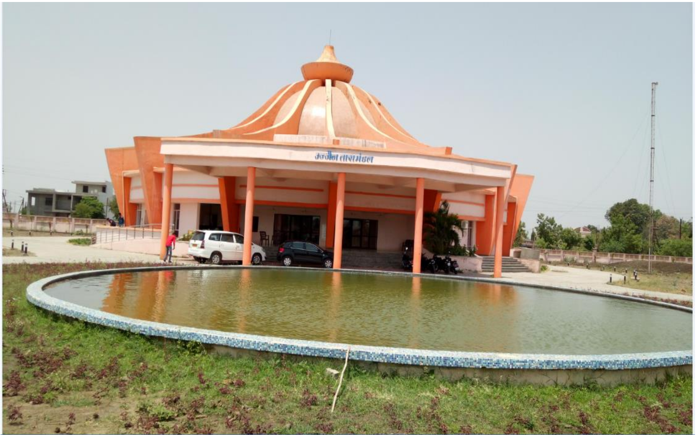
Existing planetarium at site.